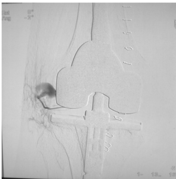
Figure 4 Intraoperative image from C arm showing pseudo aneurysm originating from superior lateral geniculate artery.