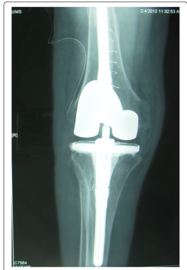
Figure 2 Postoperative AP radiograph of the right knee joint.

postoperative period was uneventful and one unit blood was transfused to compensate for intra operative losses. Drain was removed 24 hrs after surgery. Static quadriceps exercises were started followed by knee mobilization on third day. On fourth post operative day, patient complained of increasing pain and swelling over the knee joint. The swelling was warm, tender, non pulsatile and any passive or active motion aggravated the pain. There was no neural deficit with good posterior tibial and dorsalis pedis pulses and normal capillary refill. Blood chemistry and coagulation profile were normal. Initially the limb was elevated and cold compresses were applied. Within the next two hours, swelling rapidly increased in size extending into distal thigh (Figure 3). Urgent Doppler ultrasound was performed which revealed pseudo aneurysm of size 3.5 \times 2.3 \text{ cm}^2 arising from a vessel on lateral aspect of knee joint but its vessel of origin could not be identified. A subsequent angiogram revealed pseudo aneurysm originating from superior lateral geniculate artery (Figure 4). Using a micro catheter, a sub selective catheterization of the superior lateral genicular