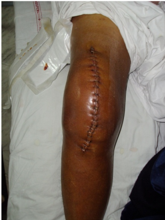
Figure 3 Clinical image of the patient's knee showing massive swelling.