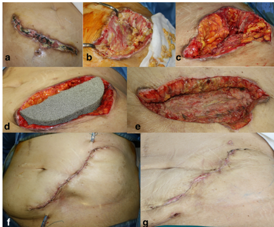
Figure 2 Phases of surgical treatment. Patient presenting with a dehiscent abdominal wound colonized by Acinetobacter baumannii after kidney transplant (a). Serial wound debridements (b, c). Negative pressure dressing (V.A.C. GranuFoam Silver®) positioned (d). Clinically satisfactory appearance, with healthy granulating tissue despite still positive microbiological cultures (e). Primary closure, 2 days post-operatively (f), and 2 weeks post-operatively (g).

The two series of patients were not different in terms of sex, age, etiology of immunodeficiency, size of the