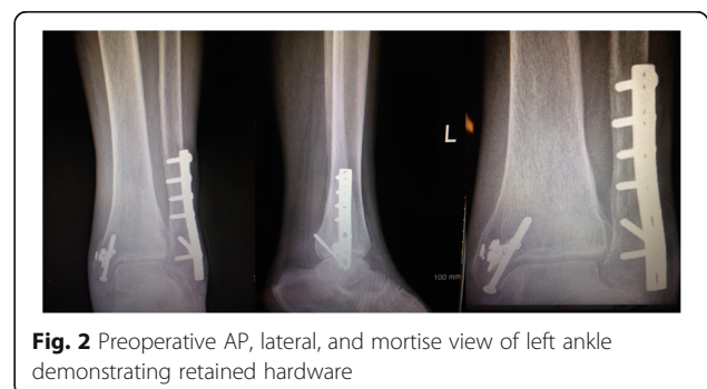
Fig. 2 Preoperative AP, lateral, and mortise view of left ankle demonstrating retained hardware