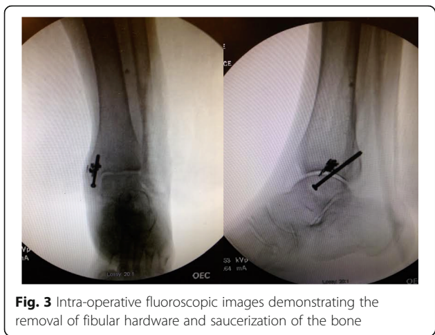
Fig. 3 Intra-operative fluoroscopic images demonstrating the removal of fibular hardware and saucerization of the bone

fluconazole was continued for coverage of both candida species. A week later the patient was taken to the operating room for another irrigation and radical debridement of necrotic bone, saucerization, and wound closure. Intra-operative fluoroscopic images are shown in (Fig. 3). A NPWT dressing was placed with scheduled changes on floor every three days. A variable course treating the