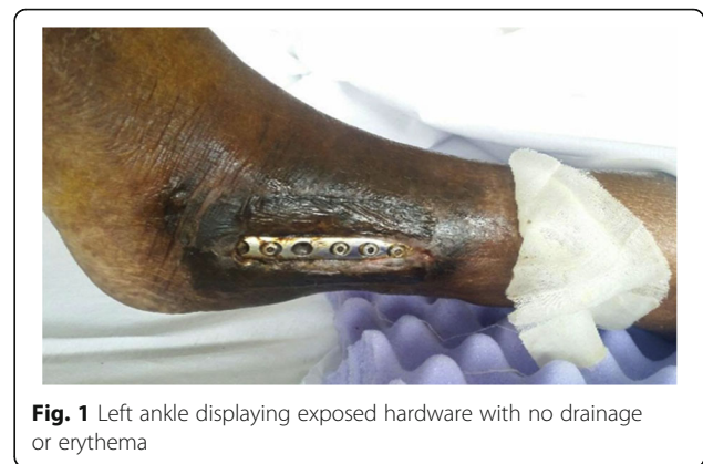
Fig. 1 Left ankle displaying exposed hardware with no drainage or erythema

During her initial work up the diagnosis of multilobular pneumonia was made and she was started on linezolid and aztreonam while initial blood cultures were negative. The