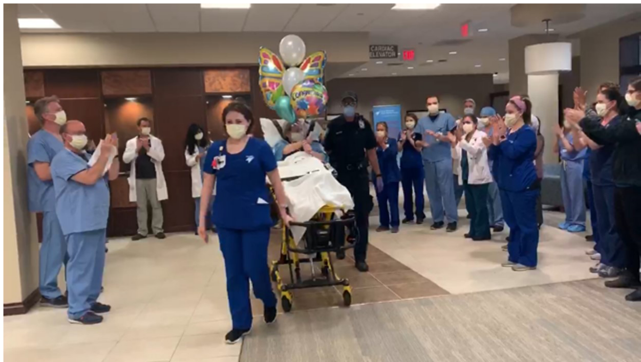
Fig. 2 Farewell reception by hospital staff at the Medical Center of Aurora to the COVID-19 survivor discharging to rehabilitation on hospital day 28

program consists of a multi-disciplinary team of specialists in which all major clinical decisions on ECMO patients are discussed during comprehensive twice daily team rounds attended by intensivists, cardiac surgeons, perfusionists, critical care nurses, pharmacy, and respiratory therapy, as previously described [16]. Monitoring of the ECMO circuit is performed by the perfusion team with 24/7 in-house coverage [16]. The current literature established a consensus that optimal outcomes in patients with profound respiratory failure and ARDS are achieved at specialized centers with full institutional commitment to advanced respiratory therapies [17].